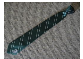
Ties optional for all students

Senior jersey to be worn by current Year 11 and 12 students only