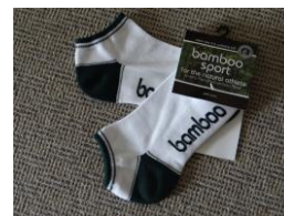
White or black short socks