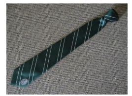
Ties optional for all students

Senior jersey to be worn by current Year 11 and 12 students only